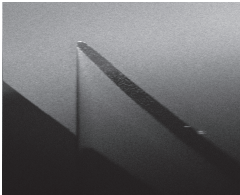
The high resolution of the Cobra 800 enables high clarity nondestructive imaging of sharp features like a contact lens edge.